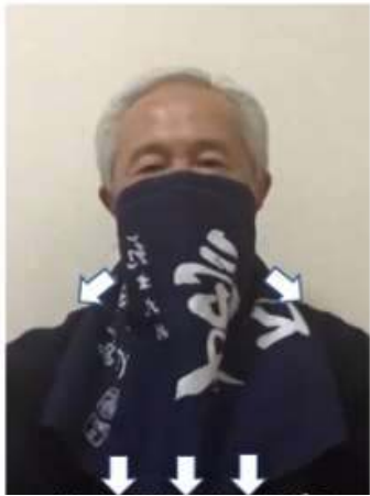
Air escapes downwards and sideways